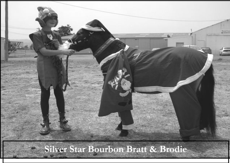
Silver Star Bourbon Bratt & Brodie